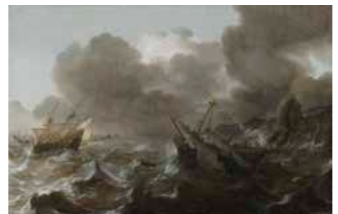
Jan Porcellis (1584-1632)