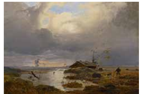
Andreas Achenbach (1815-1910)