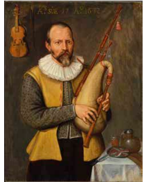
Northern Netherlandish 6 School (17 th century)