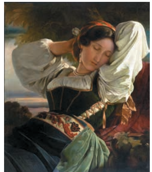
Franz Xaver Winterhalter (1805-1873)