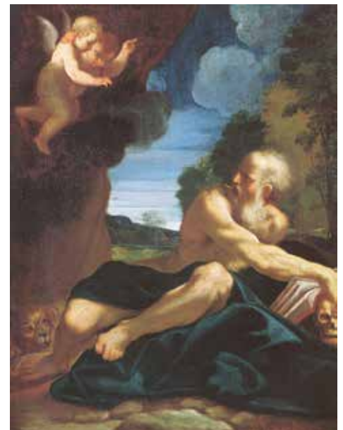
Lodovico Carracci (1555-1619)