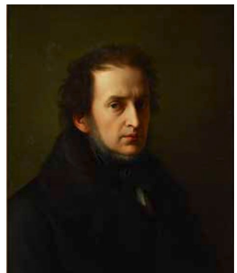
Wilhelm Schadow (1788-1862)