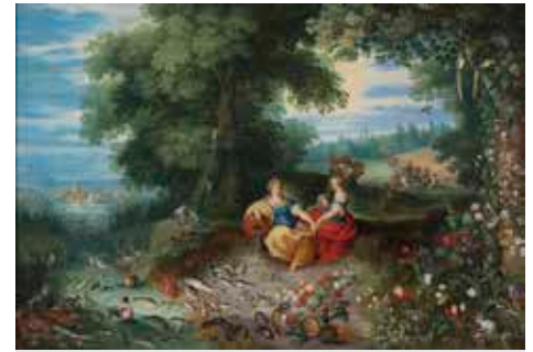
Jan Brueghel the Younger (Brueghel II) (1601-1678)