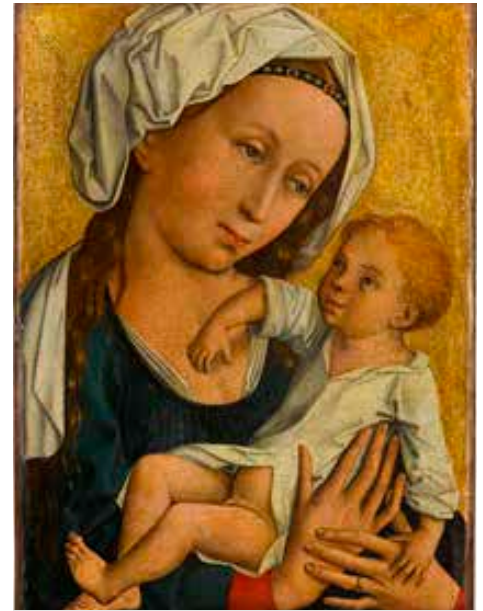
Master of Flémalle (1375-1444)